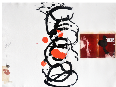
Second Chance No.17 (Focus) Collage, embedded book cover and acrylic on handmade paper 101 x 78cm 2016