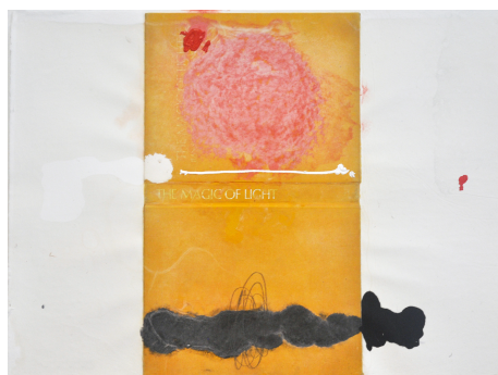
Second Chance No.29 (The Magic of Light) Collage, embedded book cover and acrylic on handmade paper 61 x 46cm 2016